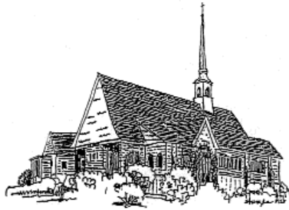
All Saints' Church, Rehoboth Beach

much truth to what he said. Few in the world are asked to be martyrs, that is not what God asks of us. Our faith reveals that through the cross of Christ, the Lamb of God, the sins of the whole world are taken away.